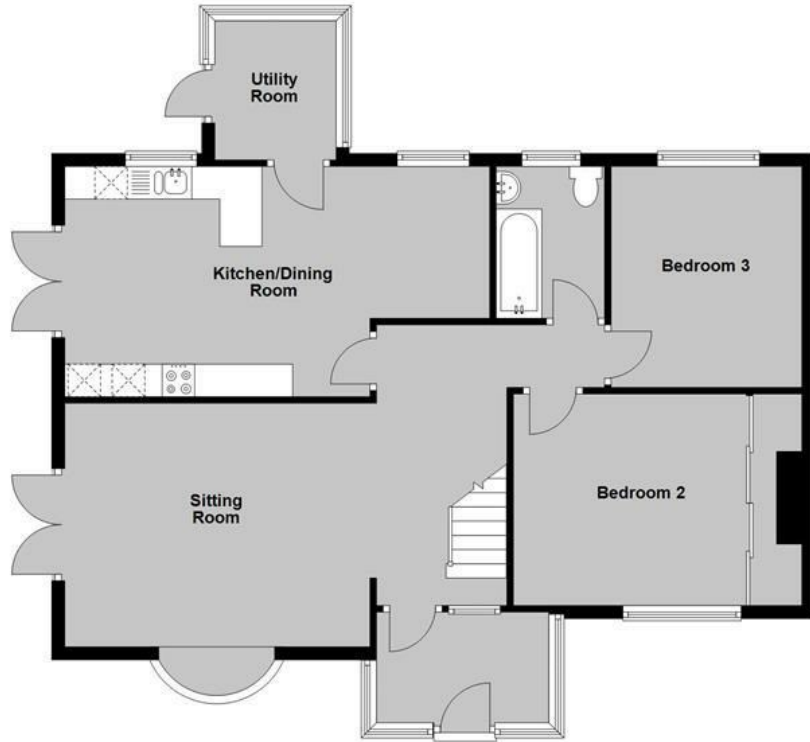
First Floor Approx. 42.1 sq. metres (452.7 sq. feet) (excluding Eaves)