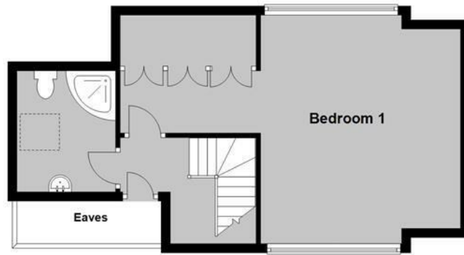
Total area: approx. 130.6 sq. metres (1405.9 sq. feet)

Council Tax Band C. The amount payable under tax band C for the year 2025/2026 is £2,131.55.